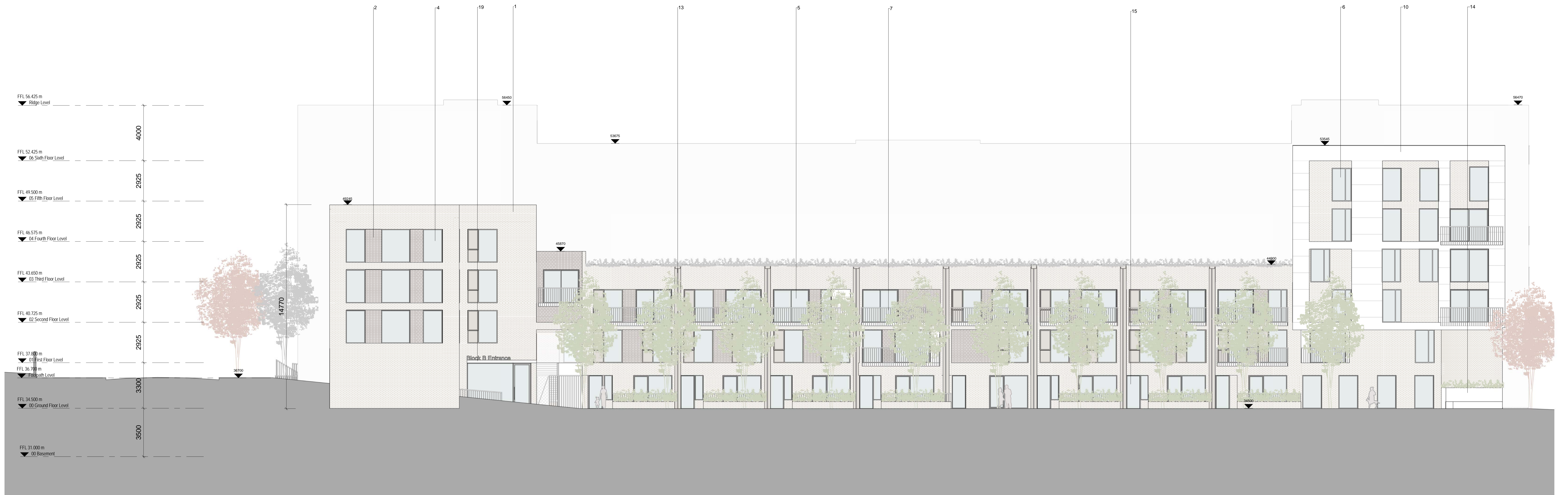
1 Elevation SW 1 : 100